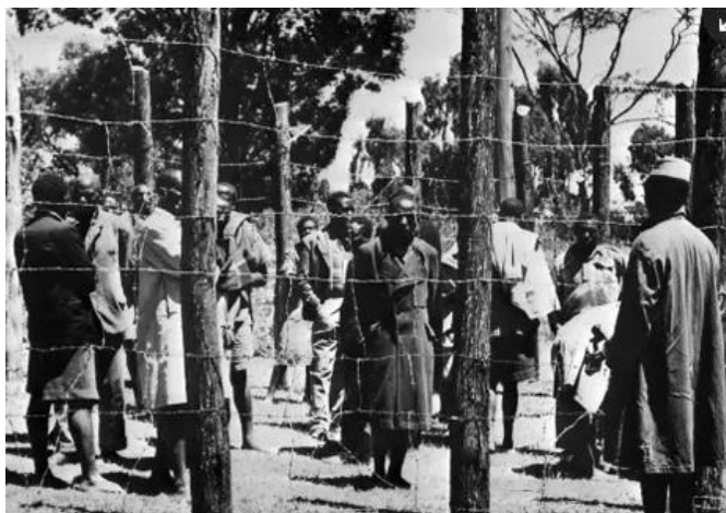
The British placed suspected Mau Mau sympathizers in concentration camps.