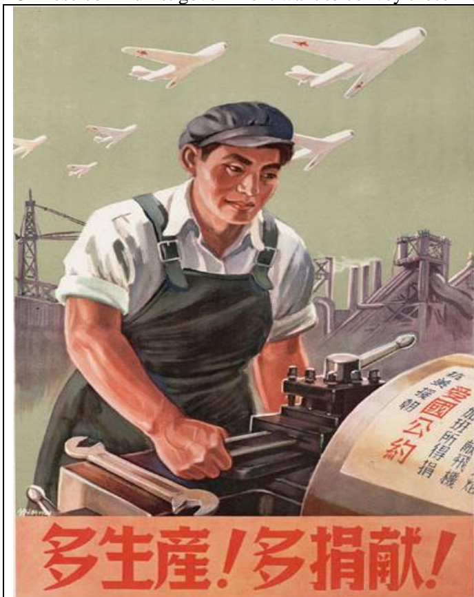
Produce more! Contribute more! (1951)

Instructions: Examine each of the posters. What messages do they convey? In your opinion, why would the Chinese communist government want to convey these messages?