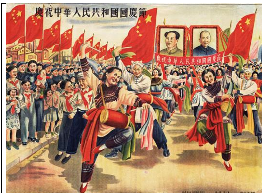
Celebrating the People's Republic of China's National Day (1950)