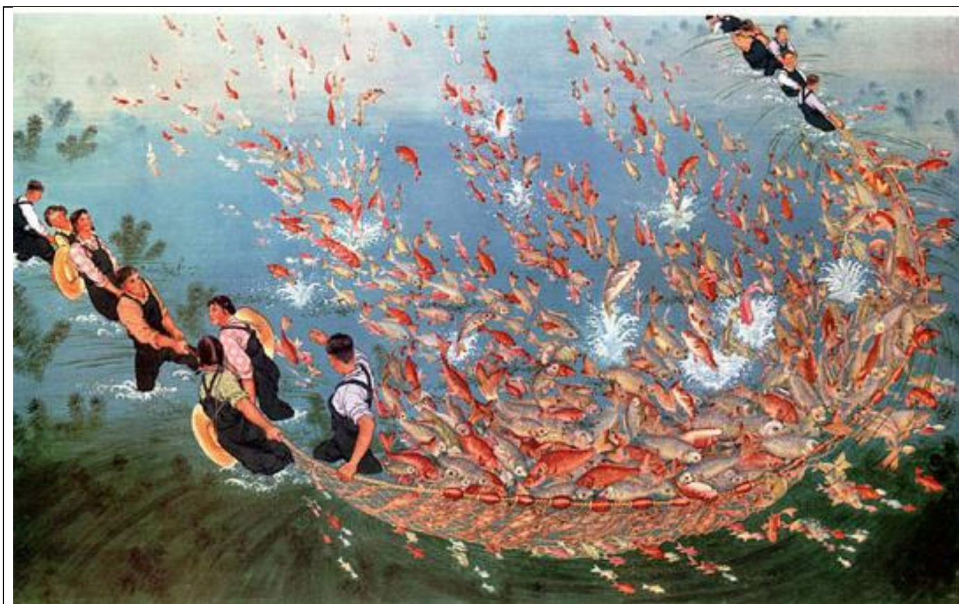
The commune's fishpond (1973)