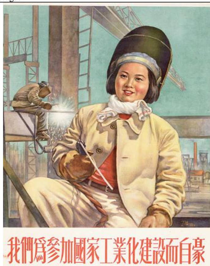
We are proud of participating in the founding of our country's industrialization (1954)