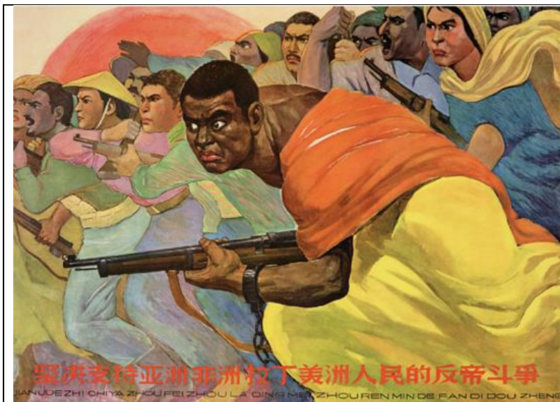
Vigorously support the anti-imperialist struggle of the peoples of Asia, Africa and Latin America (1964)