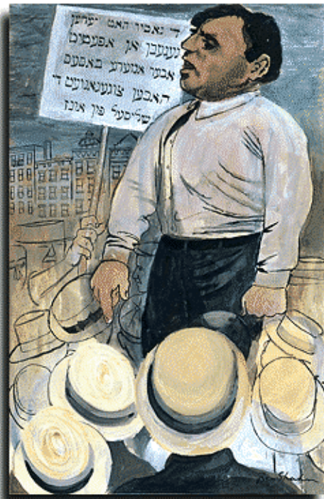
Ben Shahn, East Side Soap Box, 1936