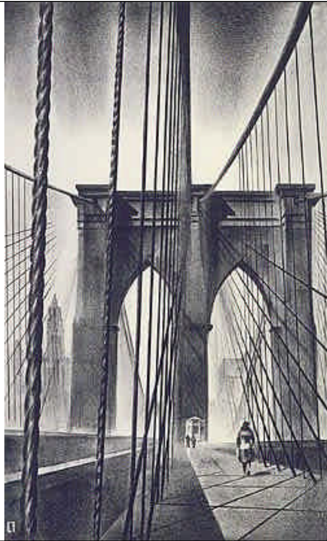
Louis Lozowick, Brooklyn Bridge (1930)