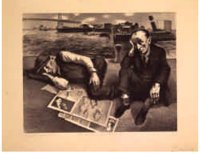
Nicolai Cikovsky, On the East River (c. 1934)