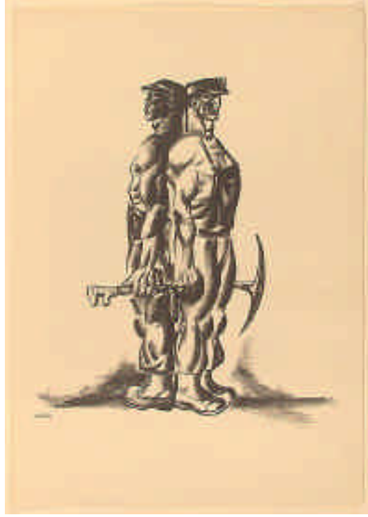
Hugo Gellert, The Working Day, no. 37 (c. 1933)