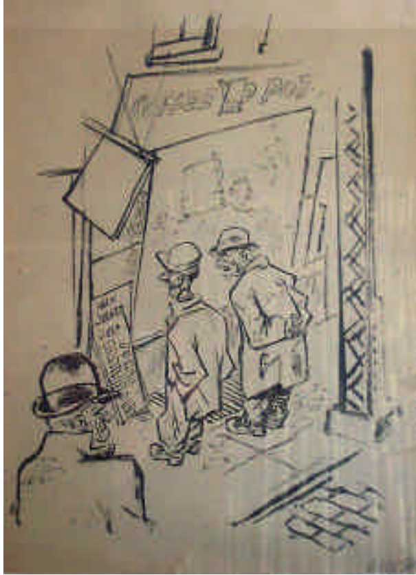
William Gropper, The Coffee Pot (1932)