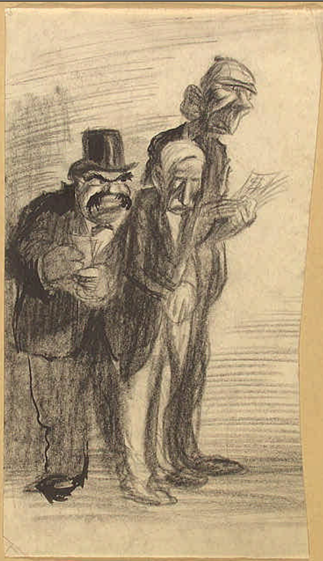
Robert Minor, Morgan, Mellon, and Rockefeller (c. 1922)