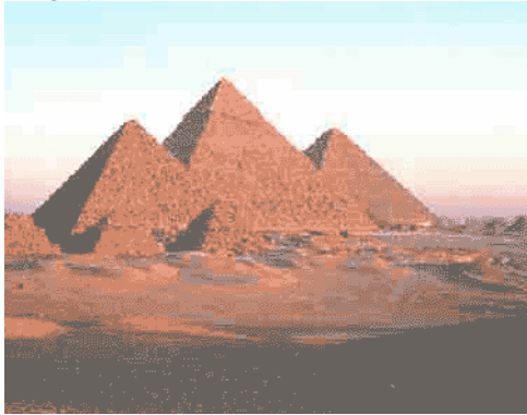
Nile River Valley, Egypt

A great historical mystery is the construction of similar pyramids along the Nile River in Ancient Egypt and on the Yucatan Peninsula in Mexico by pre-Columbian Mayans. Is this an example of a connection between these civilizations separated by the Atlantic Ocean (cultural diffusion) or of an independent architectural discovery (parallel development) on different continents? Examine the pictures and decide what you think (Photos of the Parthenon, Temple of Zeus and the Canadian Rockies by Alan Singer).