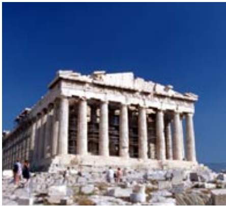
Athens, Greece - Parthenon

How are the Egyptian and Mayan pyramids similar and different?