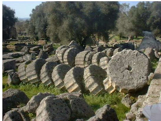
Temple of Zeus, Olympia

Temples such as the Parthenon in Athens could not be built as high as pyramids. They were not stable. The weight of the cross pieces was very heavy and the pillars that supported them could topple.