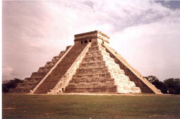
Chichenitza, Yucatan Peninsula, Mexico

How are the Egyptian and Mayan pyramids similar and different?