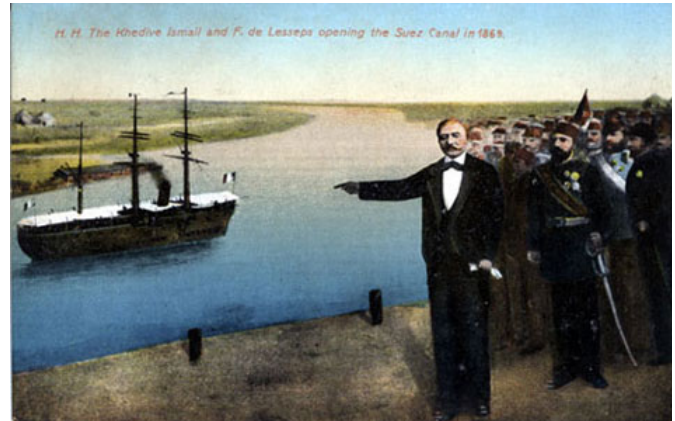
French Postcard of de Lesseps at Suez Canal Opening.

Construction of a canal across the Isthmus of Panama was considered by Spanish conquistadors as early as the 1520s. A survey was ordered and a working plan for a canal was drawn up in 1529. However, it was not until 1819 that the Spanish government authorized the construction of a canal and created a company to build it. These plans were interrupted by revolutionary movements in Latin America. Surveys made between 1850 and 1875 showed two