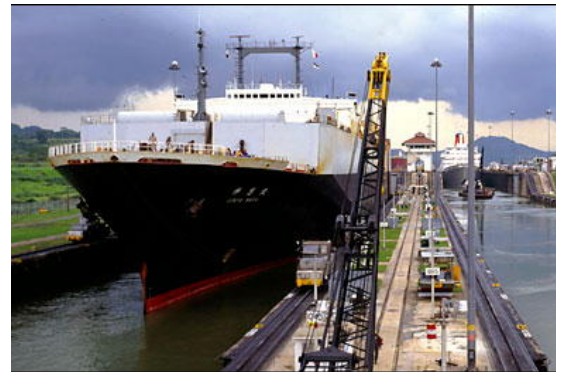
Miraflores lock on the Panama Canal.

Construction of the Panama Canal under the direction of U.S. army engineer Colonel George Goethals involved battles against disease, such as malaria and yellow fever, as well as the development of new engineering techniques, designing a lock system, and mobilization of a work force of about 25,000 people from across the Caribbean. Along the route of the canal there are a series of three sets of locks which lift ships over the central mountains and equalize the water levels of the Atlantic and Pacific Oceans.